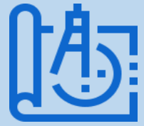
Full System Design