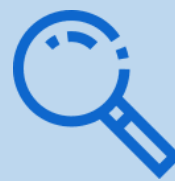
Service & Maintenance