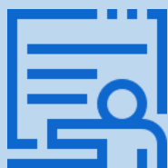
Training & Handover