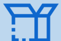
Parts & Spares