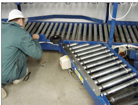
Installation of the roller track conveyor system.