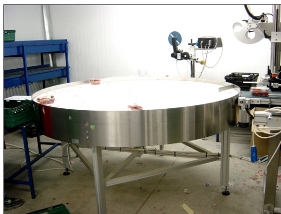
Rotating storage table 'C' where punnets collect, ready for immediate delivery to the super markets.