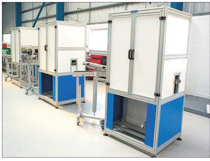
Vision Enclosures for automatically inspecting automotive brake pads ready for shipping to Federal Mogul.

A modern fully enclosed enclosure, built using our MONEX extruded aluminium alloy frame building system with opaque in-fil panels and conveyors from our standard range.