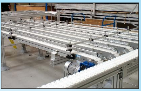
Automatic stores being built in our factory.