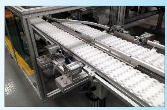
Merge unit at infeed to stores.