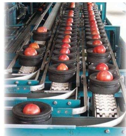
Conveyor for food packaging

For further information, please contact: