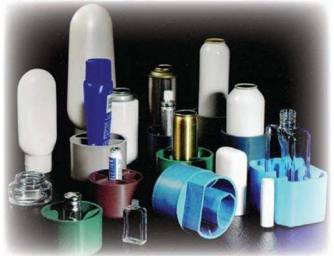
Various types of pucks that can be used with our technology

The PW150 puck washer is an automated, inline puck cleaner and dryer. Common options include: solvent feed, wash recirculation, fresh water rinse, blow dry, and vision inspection.