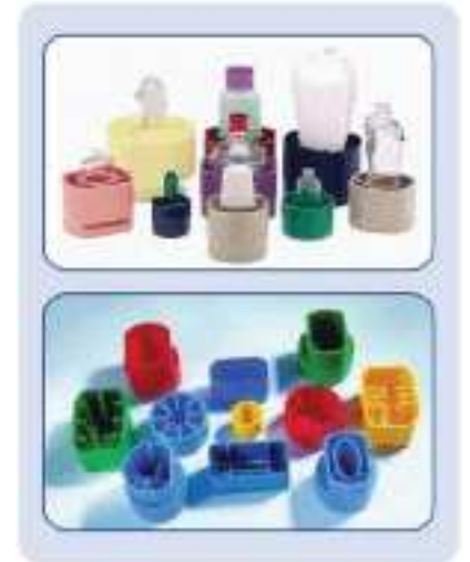
Various types of puck available

MODU System's state-of-the-art puck handling products are designed to aid in the mass production of packaged products while decreasing labor and increasing throughput and profitability. The following standard products represent the most common machinery utilized in puck technology packaging systems.