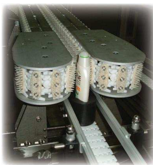
Shampoo depucking conveyor